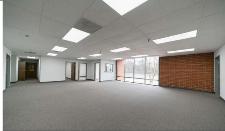
Reception Area: new LED Lights, flooring and paint