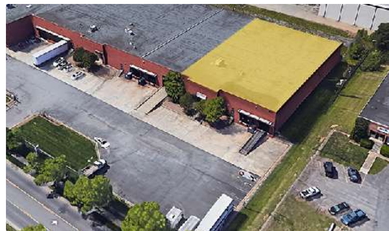
Suite A: ±17,454 total square feet, end cap unit