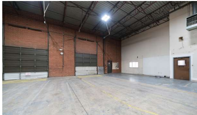
Warehouse: new LED Lights