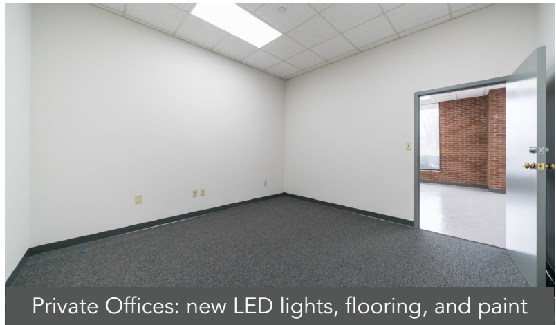
Private Offices: new LED lights, flooring, and paint