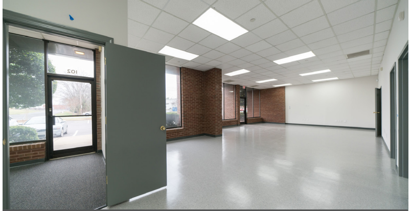
Front Showroom: new LED lights, flooring and paint