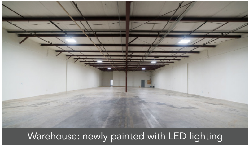
Warehouse: newly painted with LED lighting