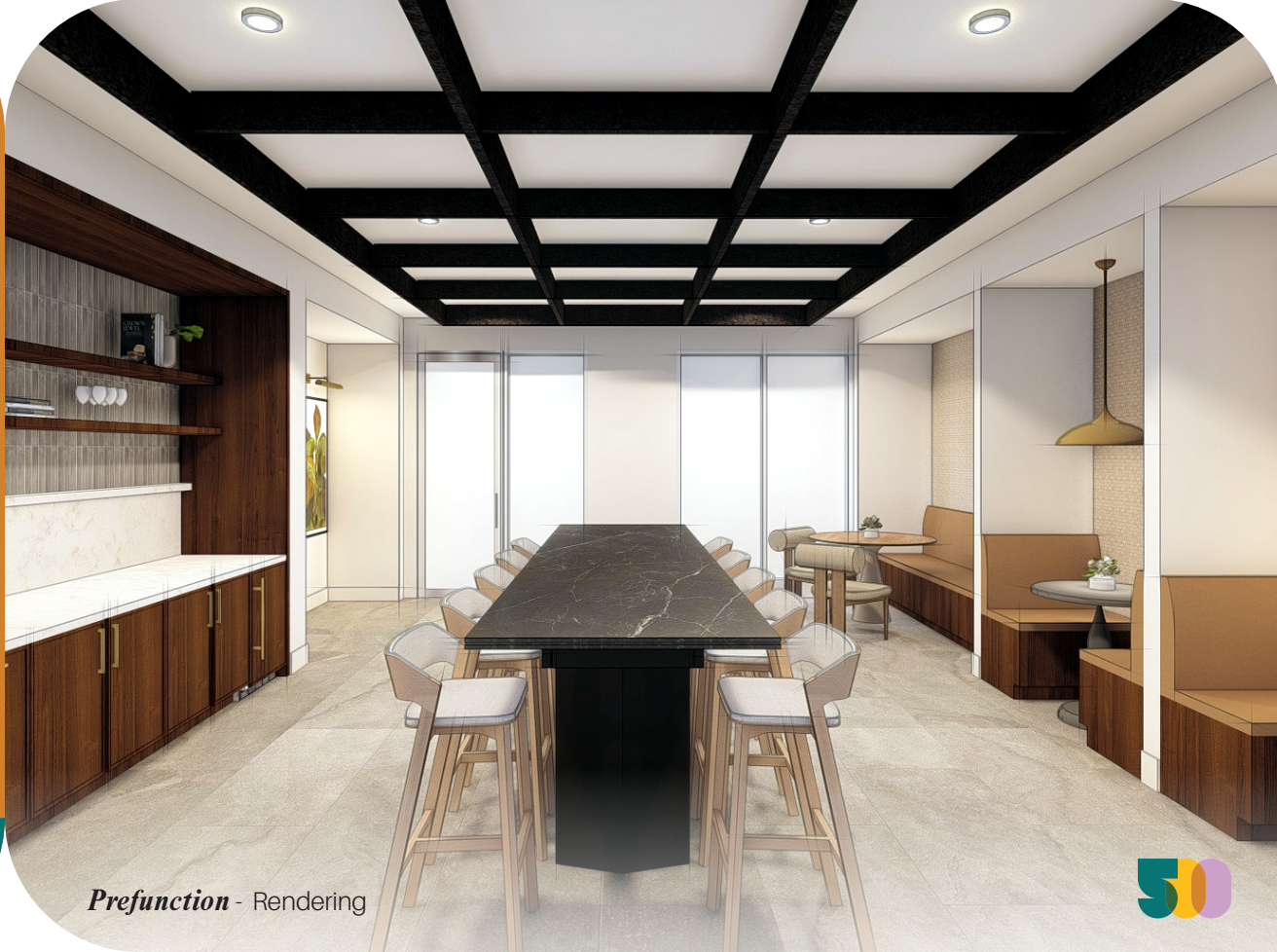
Prefunction - Rendering

With three points of entry, direct access across multiple floors, and a 3 per 1,000 SF parking ratio