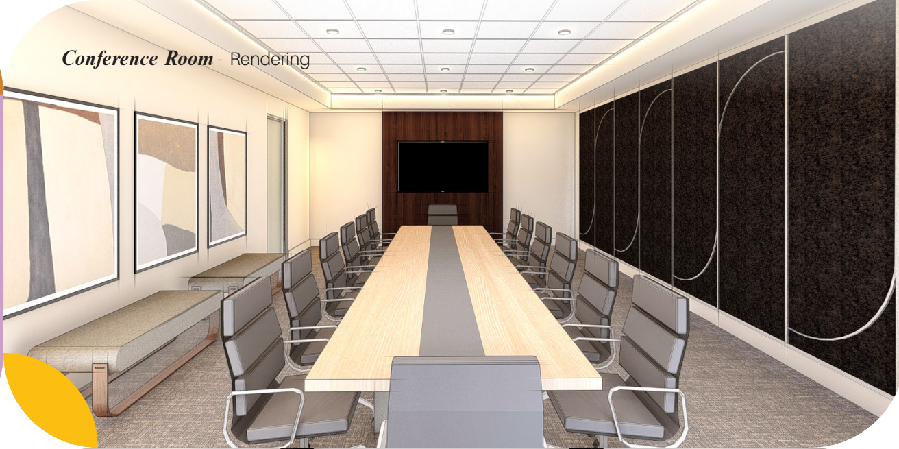
Conference Room - Rendering