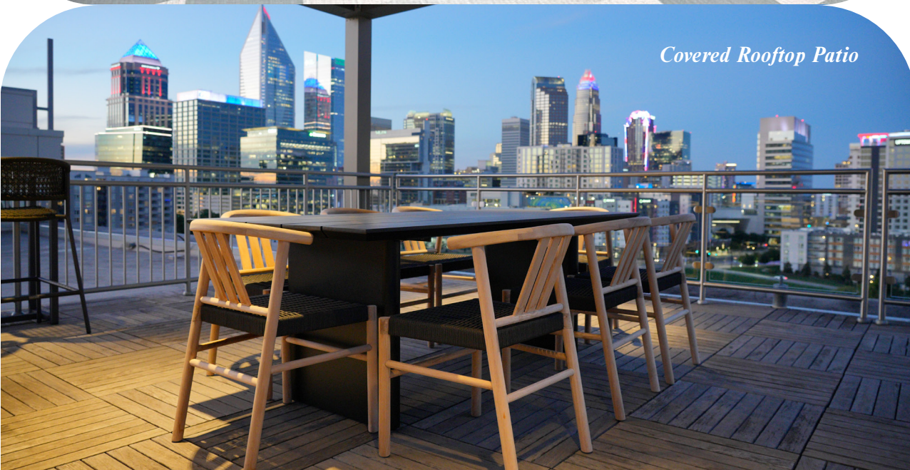
Covered Rooftop Patio

Complete with access to a refrigerator, sink, and restroom