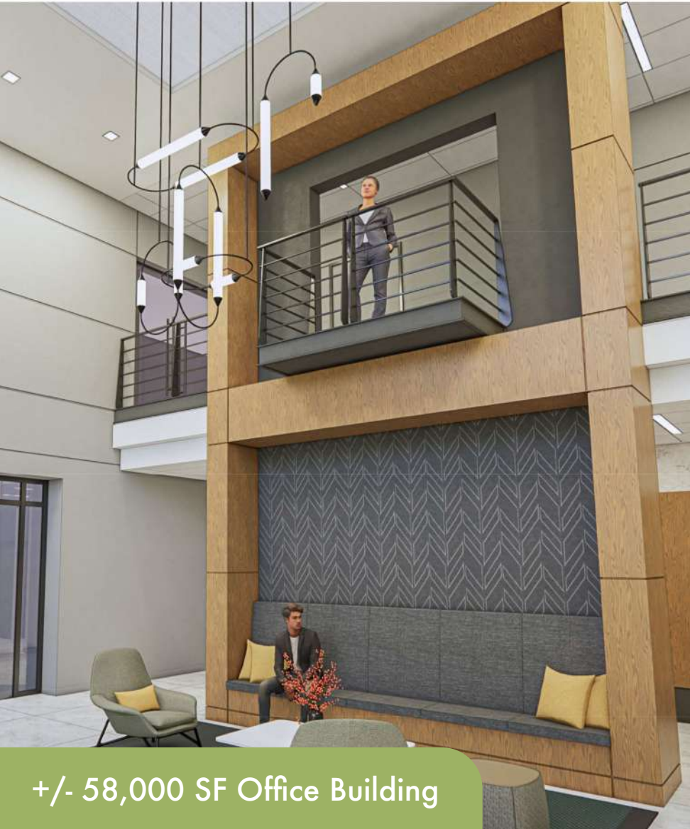
+/- 58,000 SF Office Building

702 Oberlin is located adjacent to Village District with abundant restaurant, shopping, and fitness amenities. Major capital improvements are in process including lobby, restrooms and the exterior façade with a completion date of December 2022. Conveniently located minutes from Downtown Raleigh, I-440, and Wade Avenue.