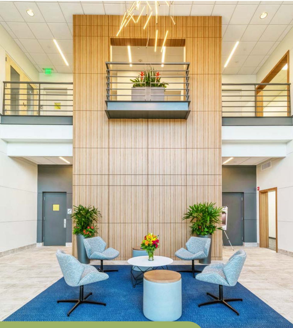
+/- 58,000 SF Office Building

702 Oberlin is located adjacent to Village District with abundant restaurant, shopping, and fitness amenities. Major capital improvements are in process including lobby, restrooms and the exterior façade with a completion date of December 2022. Conveniently located minutes from Downtown Raleigh, I-440, and Wade Avenue.