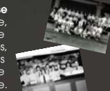
Carolinac Auto Supply Counter Crew