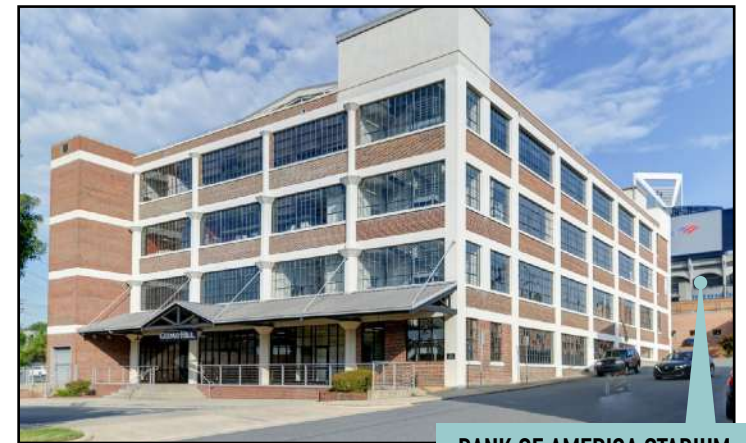
BANK OF AMERICA STADIUM