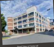
Street View of Cedar Hill