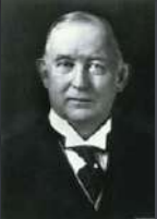
James Buchanan Duke (1856-1925)

Piedmont and Northern Railway: On March 20, 1909, the Greenville, Spartanburg and Anderson Railway of South Carolina was chartered and presided over by Duke. An extension from Greenville to Spartanburg was completed in April 1914. The North Carolina division started with the Piedmont Traction Company, also owned by Duke, and completed its route between Charlotte and Gastonia, North Carolina on July 3, 1912. The two companies merged into the Piedmont Northern Railway connecting Charlotte, NC and Greenville, SC.