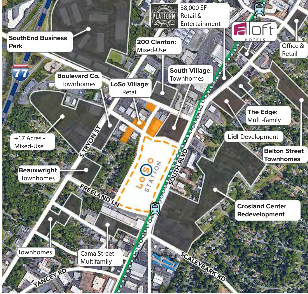
*Future developments in planning or currently underconstruction.*