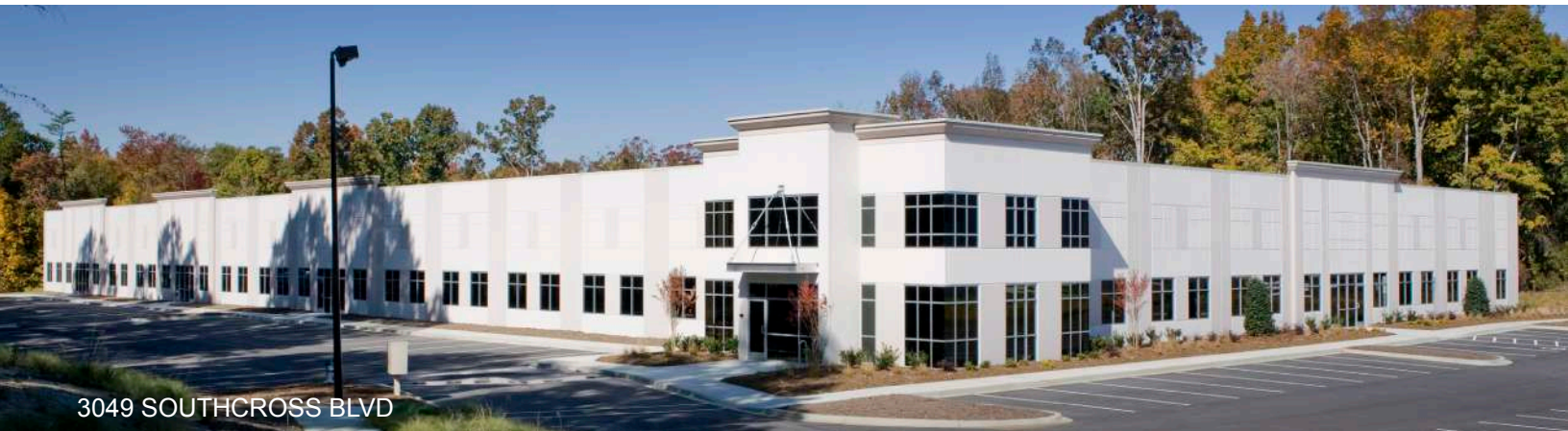
3049 SOUTHCROSS BLVD