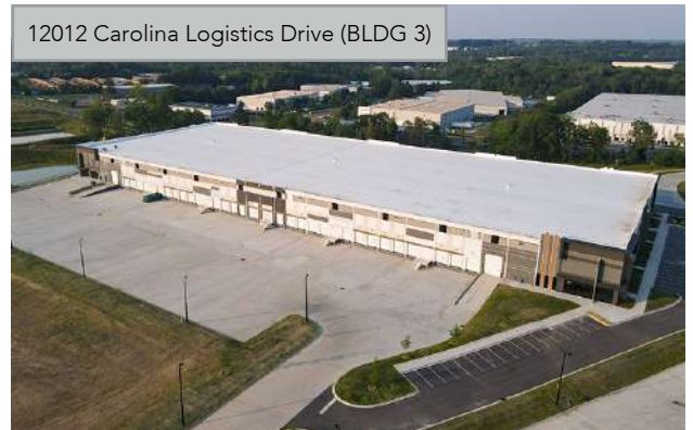
12012 Carolina Logistics Drive (BLDG 3)